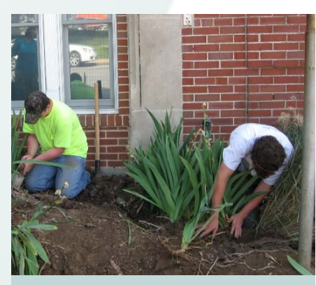
FFA students busy planting for downtown business.

Further downtown enhancement projects include new "urban friendly" trees, more benches and decorative trash receptacles.