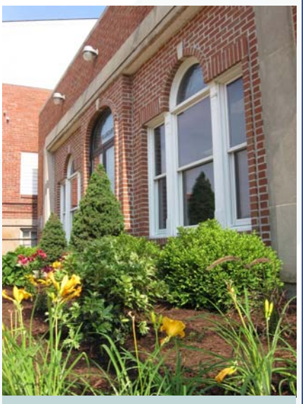
FFA students recently completed this landscape on Locust Street.